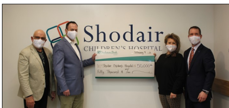
Pictured to the left are Shodair Foundation members and representative from Stockman Bank. To the right are Shodair employees with Helena Area Realtors. Both recently made donations to Shodair's building project and we are very grateful!

Helena businesses and organizations continue to support Shodair Children's Hospital. Helena's Association of Realtors and Stockman's Bank have recently stopped by the hospital to present donations to Shodair. In these unprecedented times, we are extremely thankful for Helena's continued support!