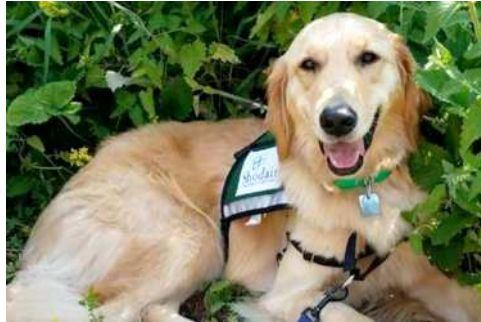
Blue Bonnet –Shodair's Facility Dog

Program Director: Oversees operations of both Acute units.