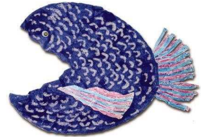
Artwork by a Shodair patient

For your safety and that of everyone at Shodair Children's Hospital, we will protect your confidentiality. Patient information may be released only when an "Authorization of Release of Health Care Information" form has been signed and/or the patient confidentiality number has been provided. A copy of the Patient Bill of Rights and Privacy Practices are included in this pamphlet.