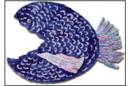
Artwork by a Shodair patient

For your safety and that of everyone at Shodair Children's Hospital, we will protect your confidentiality. Patient information may be released only when an "Authorization of Release of Health Care Information" form has been signed and/or the patient confidentiality number has been provided. A copy of the Patient Bill of Rights and Privacy Practices are included in this pamphlet.