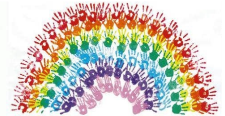
Artwork by Shodair Patients