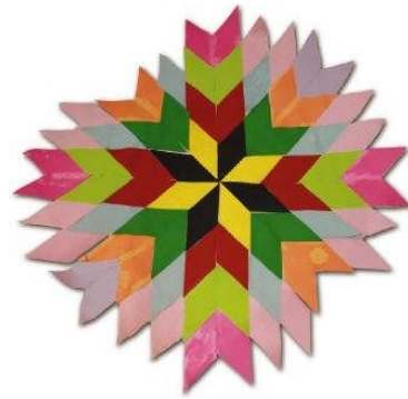
Artwork by a Shodair patient

Licensed Practitioner: Shodair's team of Licensed Practitioners are trained with a focus on psychiatric care. The Child and Adolescent Psychiatrist or Psychiatric and Mental Health Nurse Practitioner leads the team and is responsible for final decisions about your child's treatment. Licensed Practitioners meet with patients individually and consult regularly with other treatment team members.