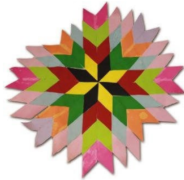
Artwork by a Shodair patient