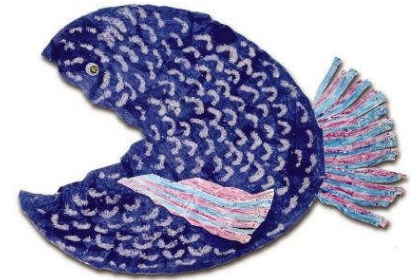
Artwork by a Shodair patient

For your safety and that of everyone at Shodair Children's Hospital, we will protect your confidentiality. Patient information may be released only when an "Authorization of Release of Health Care Information" form has been signed and/or the patient confidentiality number has been provided. A copy of the Patient Bill of Rights and Privacy Practices are included in this pamphlet.