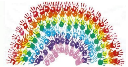
Artwork by Shodair Patients